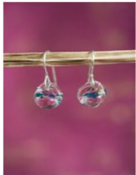
ee0910 Crystal Lake

Surgical steel earwire and leaf component. Natural pearl. Colors vary. Length: 7/8"