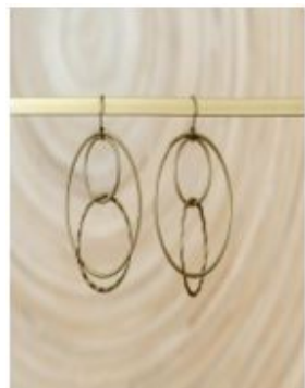
ee1423 Peony (New)

Silver-plated earwire with chain and glass flower bead. Colors vary. Length: 2 1/2"