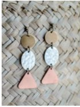
ee1613 Sage (New)

Gold-filled post earwire. Carnelian & moss agate gemstone. Turquoise colored bead. Colors vary. Length: 2 1/4"