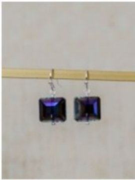
ee1019 Violet (New)

Gold-plated earwire with gold-plated chain and pom-pom charm. Colors vary. Length: 2"