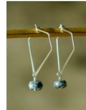
ee1416 Rocky Road

Antiqued sterling silver earwire. Faceted moonstone bead. Length: 1 1/4"