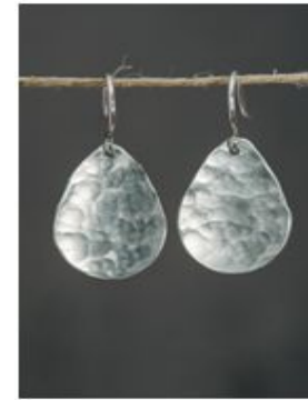
ee1202 Patron Silver

Silver plated earwire with faceted glass bead. Colors . Length: 1 1/4"