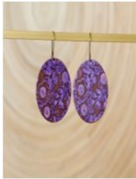
ee1218 Wildflowers (New)

Sterling silver earwire. Nickel silver and copper charms. Length: 1 1/2'