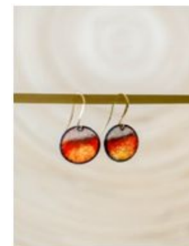
Ee0916 Sunflower (New)

Gold-plated ball post earwire and components. Studio etched and patinated copper charm. Length: 1"