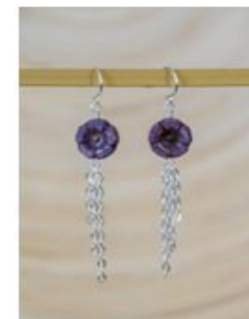
ee1422 Flora (New)

Gold-plated earwire. Copper and gemstone accent beads. Gemstone teardrop bead. Colors vary. Length: 1.5"