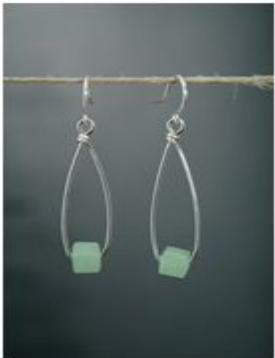
ee0711 Arrack Attack

Gold-plated earwire and patinated filigree fan. Faceted glass bead. Bead colors vary. Length: 1 3/4"