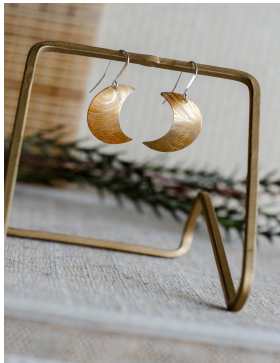
ee1220 Posey (New)

Antique brass earwire with resin and wood charm. Colors vary. Length: 2"