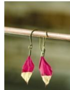
ee1216 Tutti Frutti

Silver-plated earwire. Studio enameled copper pieces. Colors vary Length: 1 1/4"