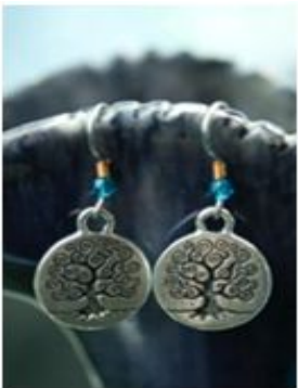
ee1205 Tree of Life

Silver-plated earwire. Hammered sterling silver teardrop. Length: 1 1/4"