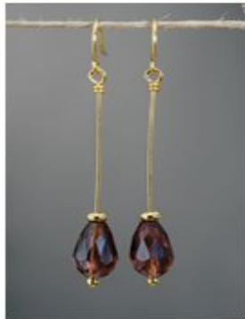
ee0712 Hot Toddy

Silver-plated earwire. Silver-plated wire with faceted crystal cube bead. Colors vary. Length: 2"