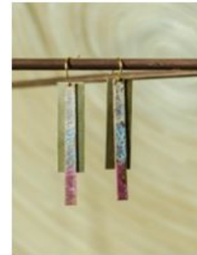
ee0714 Birthday Cake

Gold-plated earwire. Faceted glass bead with gold-plated components. Colors vary. Length: 2"