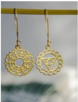
ee0715 Zinnia (New)

Gold-plated earwire. Brass rectangle and etched copper strip with studio colored patinas. Length: 2"