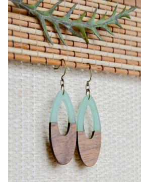
ee1219 Fern (New)

Antique brass earwire with etched copper and painted charm. Colors vary. Length: 2 1/4"