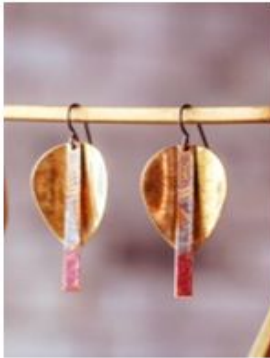
ee1016 Rum Raisin

Silver-plated earwire and components. Nickel and studio patinaed copper charms. Colors vary. Length: 1 3/4"