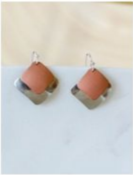
ee1217 Dulce De Leche