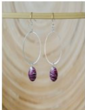
ee0716 Magnolia (New)

Gold or silver plated earwire with mismatched charms. Length: 2.5"