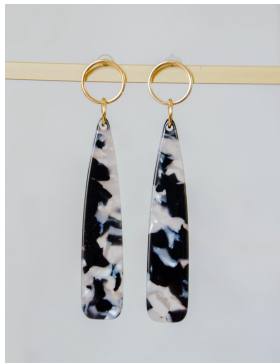
ee1417 English Toffee

Rhodium or gold-plated hoop earwire. Gemstone bead. Colors vary. Length: 1"