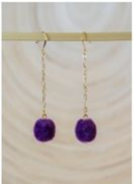
ee1018 Allium (New)

Niobium earwire. Studio etched and enameled copper charm. Gemstone or czech glass bead. Colors vary. Length: 2 1/2"