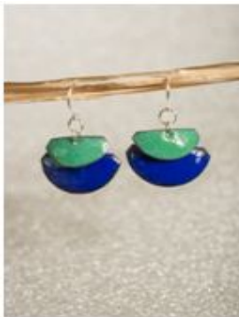
ee1211 Fond du Lac

Natural niobium earwire. Pewter charm, assorted glass color beads. Length: 1 1/2"