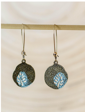
ee0809 Leaf Cutter