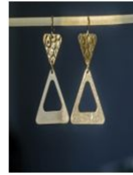
ee1614 Lily (New)

Antique brass post earwire,, brass, nickel and copper charms. Length: 2"