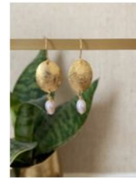
ee0813 Bourbon Praline

Silver-plated earwire. Nickel silver circle, silver jumpings with colored resin charm. Colors vary. Length: 3/4"