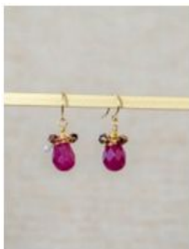
ee1421 Tangled Teardrop

Gold-filled post earwire and components. Resin charm. Colors vary. Length: 2"