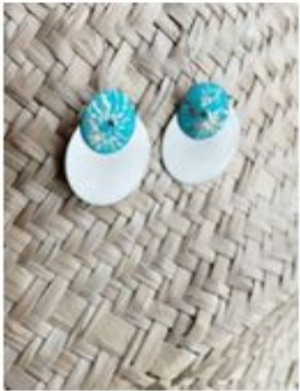
ee1015 Strawberry Swirl

Rose gold-plated ball earwire. Hammered nickel silver rectangle, faceted gemstones Colors vary. Length: 1"